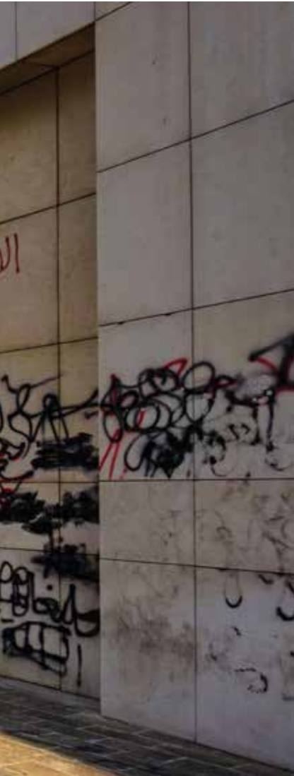
Banque du Liban, Lebanon's central bank